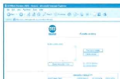
SCIS Create orders page

A virtual resource box can be created by following these steps, but not actually physically adding the resource to a box. A list of the resources can be printed and shown to the teachers. Providing records of such resources in